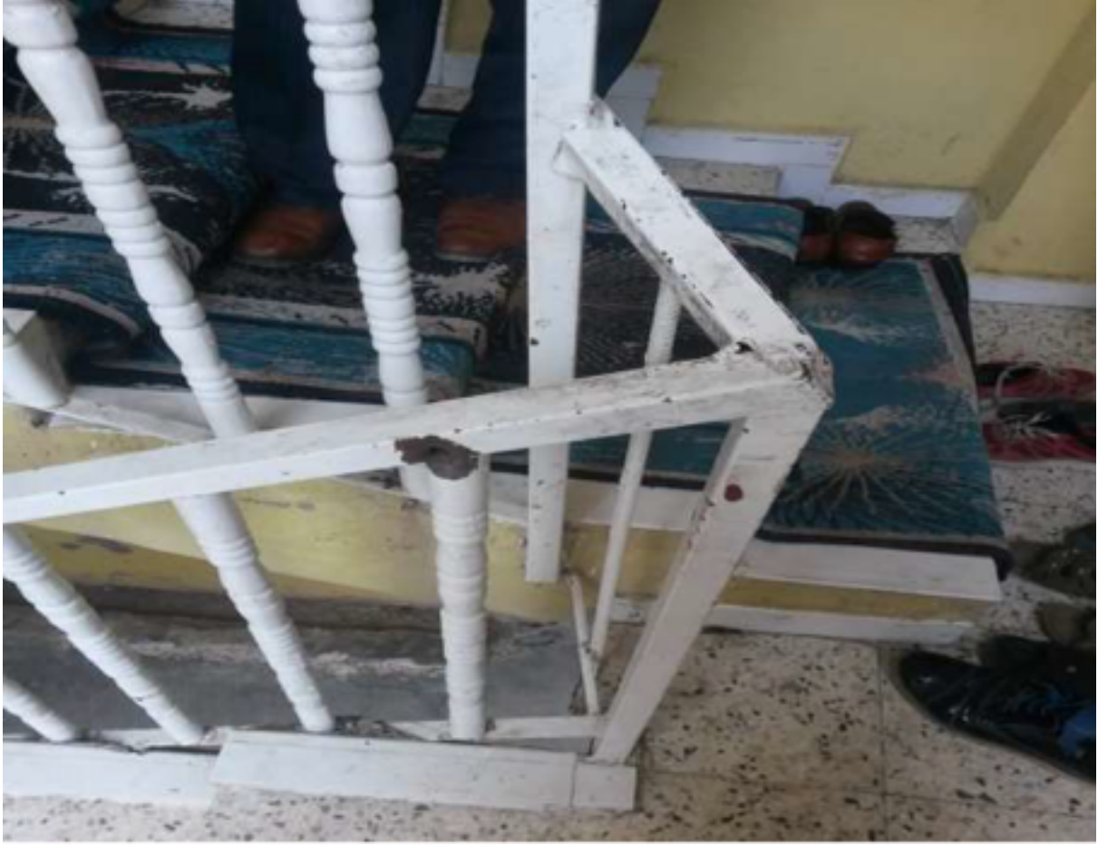
Photo 2. A bullet mark seen in the place where Miray İnce is said to have been shot.