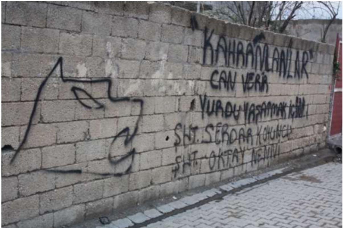
Photo 11: "Heroes sacrifice their lives to make the homeland live," says a graffiti.