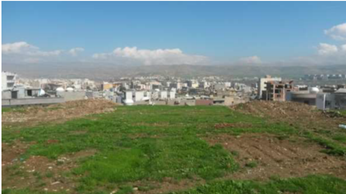
Photo 4: Locations where two tanks were allegedly deployed in Sur neighborhood toward the city center.

"The youths also made mistakes. They planted bombs here where children are playing. Is this the right place to plant a bomb? (He showed the location of what he said was a remote-controlled bomb planted next to a house). Yes, they were making people stand guard [around the trenches]. Some people were saying, "Why am I standing guard while others don't?" One person from every house was coming to stand guard. When we left our house, military members began to use it as a base. They seriously damaged the house. (The house was on a slope beside a place where two tanks were allegedly positioned facing Cizre city center. It was claimed that there was artillery fire from that spot aimed at Cizre city center)"