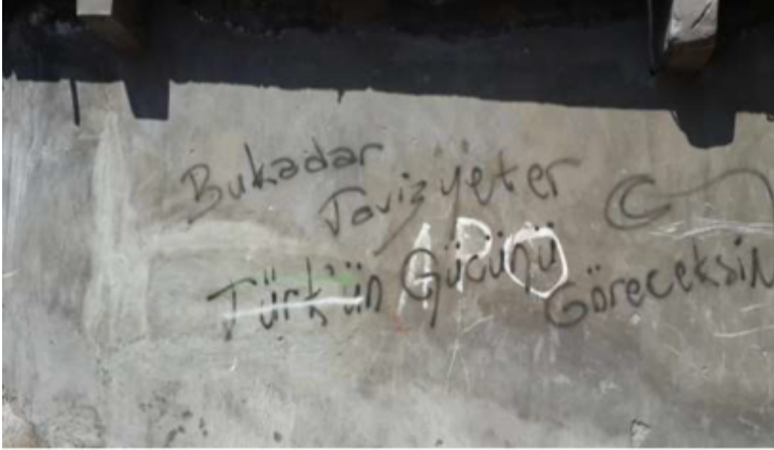
Photo 9. A note on the wall says: "Enough of so many concessions. You will see the power of the Turk."

33. The fact that security forces wrote sexist messages on the walls of some houses they used, scattered women's underwear randomly in the house, hung Turkish flags in the houses without the owners' permission, left used condoms in the house and left racist notes insulting the family owning the house is not only likely to create feelings of hatred and hostility to the state among Cizre residents but also among other Kurdish citizens who followed these incidents elsewhere. The fact that photos of controversial messages written on the walls in Cizre were shared on social media by some users during the curfew strengthens the perception that those actions were deliberate and aimed to insult people, hence destroying the social bonds among people.