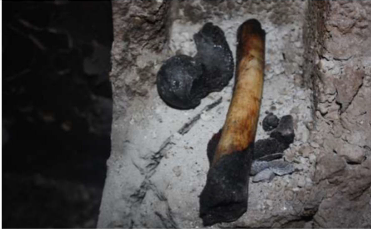
Photo 3. Fragments which are thought to be human bones found during examinations at the basement in Bostancı Street.

Osman Duymak: We were watching İMC TV. The moment we heard the news about ambulances being sent to pick up those injured in the basements, we heard sounds of bomb explosions.