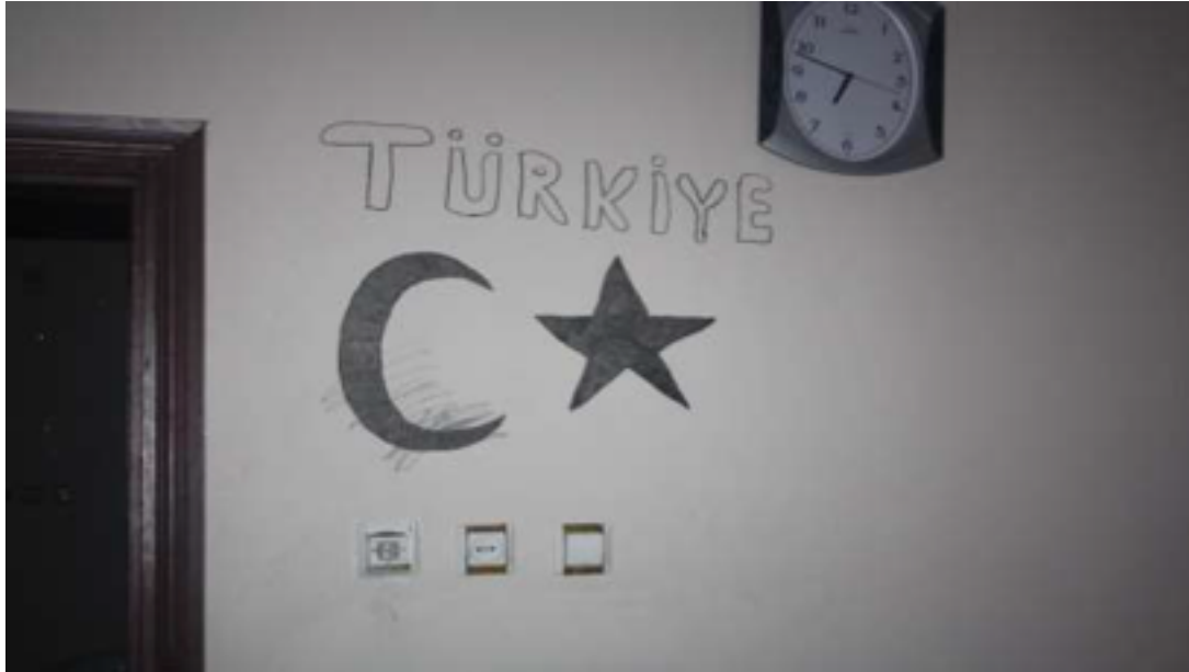
Photo 5: The word Turkey name and a crescent and star from on its flag were drawn on a wall in one Cizre resident's house.

surrounding the Sur, Nur, Yafes and Cudi neighborhoods were used as an accommodation by the security forces for a long time. The Cizre residents who returned to their houses at the end of the curfew presented some evidence to our delegation ( concerning their claims that security forces members left their faeces in their rooms and on their belongings, wrote some hateful messages on the walls and destroyed their furniture ) and had the view that all these were done deliberately and with an intention to humiliate them.