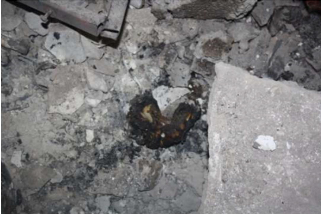
Photo 8. A fragment found during examinations at the basement in Bostancı Street is thought to be a burned foot bone.

16. There are widespread claims that some individuals who were injured during clashes were eventually brought to these basements in Cudi neighborhood because they were assumed to be safe. It is also claimed that exits from the Cudi neighborhood were under the control of the security forces as of the 45th day of the curfew, that the ambulances were made to wait in the main street and were not allowed to come closer than 600 metres' distance of the basements.