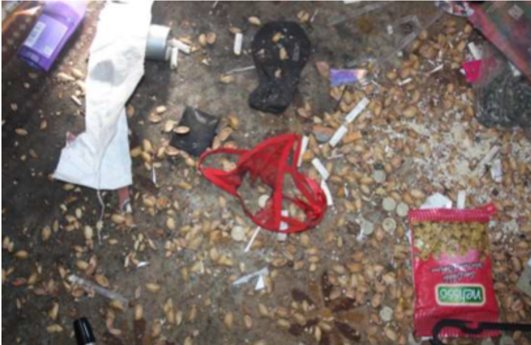
Photo 10: A home used by security forces, showing women's underwear and personal belongings strewn around.

34. Since the Cizre Chief Public Prosecutor's Office and Cizre District Governor's Office refused to give information to our delegation members during meetings with them, some of the suspicions and views we formed during our field work have not been answered. So we think there is a need to inform the public in a satisfactory way about the issues and allegations mentioned below.