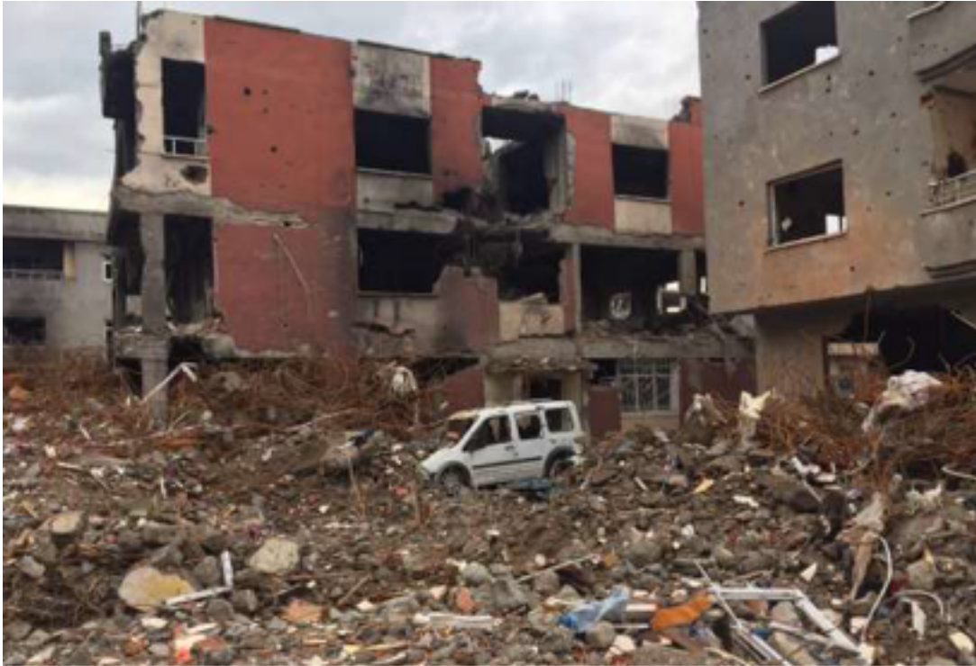
Photo 7: The place where the Narin Street building's basement was filled with rubble

14. It has not been possible to have exact information about the number of bodies that were taken out of the basements. Yet, there are claims that 32 bodies were retrieved from the first basement, 62 from the second and 45 from the third. But lawyers of the victims' families say there are discrepancies in the number of the victims in the forensic reports. Different sources put the number of bodies taken out of the basements at between 139 and 187. Since not all the victims in the basements have been identified and some families refuse to give blood samples for testing, it is thought that it will take a long time to come up with an exact number of victims in the basements.