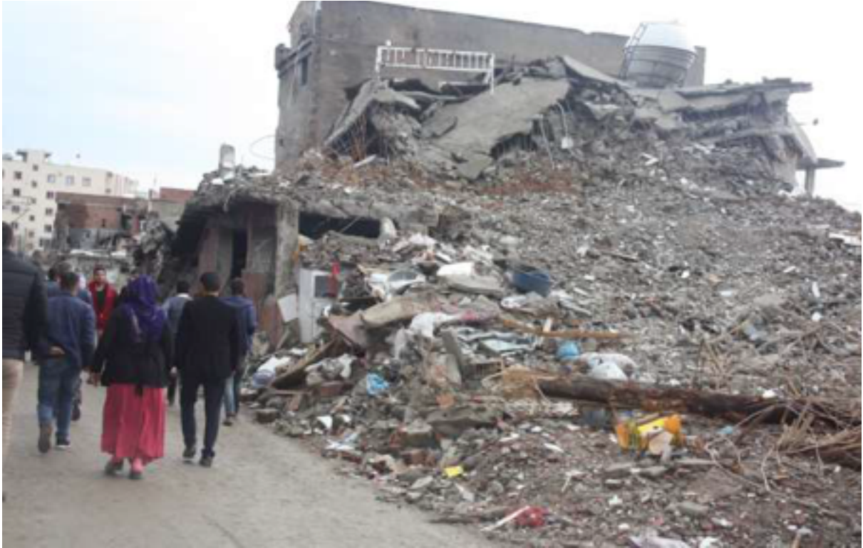
Photo 1. The outer view of the building containing the basement in Bostancı Street

days following the end of the clashes in Cizre, efforts were made to destroy evidence, bodies were taken away. There was nobody who could see what was done during those days."